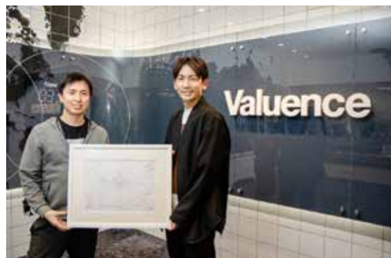
Japan-listed company Valuence expands in Hong Kong with a new sustainability initiative