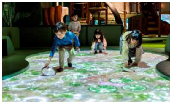
NAMCO opens first overseas DOCODOCO indoor digital adventure playground in Hong Kong