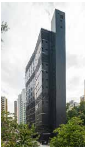
DL Holdings Group expands office space to cope with business expansion in Hong Kong 德林控股集團擴充香港辦公室配合業務發展需求

投資推廣署隨時歡迎內地及海外投資者在香港建立業務，協助他們在全球最適合營商的城市之一取得成功。我們的團隊是對各行業有深厚認識的市務人員和專家，他們為客戶在各個業務發展階段提供支援，包括初步規劃、業務開展以至進一步擴張。我們為客戶提供有關法律與規管條例的資訊、相關政府部門及專業服務轉介、宣傳工作以及商務聯宜活動。所有服務都是量身訂造，保密和免費。在2021年我們協助過的客戶包括：