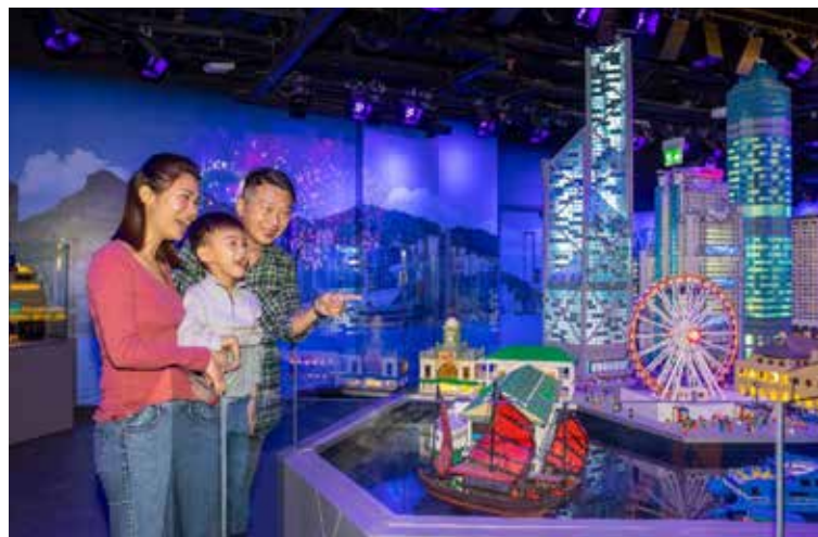
Merlin Entertainments opens LEGOLAND Discovery Centre in Hong Kong