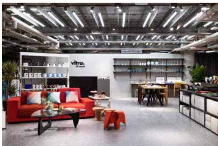
kapok opened a new flagship store in Tsim Sha Tsui bringing a selection of innovative homeware products and concepts from Swiss-based design furniture brand Vitra to the city. kapok在尖沙咀開設的新旗艦店，將瑞士設計傢俬品牌Vitra的一系列創新家居用品和意念引進香港。