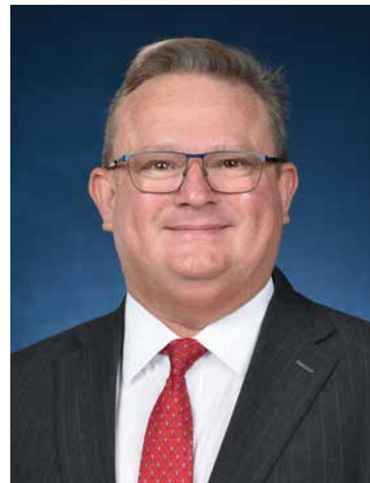
STEPHEN PHILLIPS 傅仲森

Hong Kong also plays an important role in the 14th Five-Year Plan, which places reform and innovation as the fundamental driving forces for economic growth. Most notably, our city excels as an international financial centre, a global aviation hub, a centre for international legal and dispute resolution services, an innovation and technology hub, as well as a regional intellectual property trading centre. Hong Kong will continue to play to our strengths, sharpen our positioning as well as our strategy and measures to reinforce and enhance our competitive advantages.