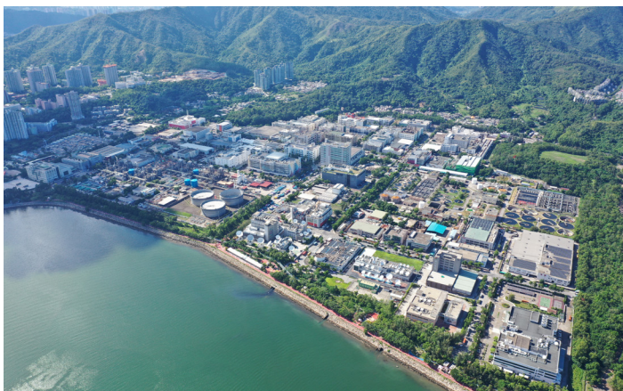
Tai Po INNOPARK